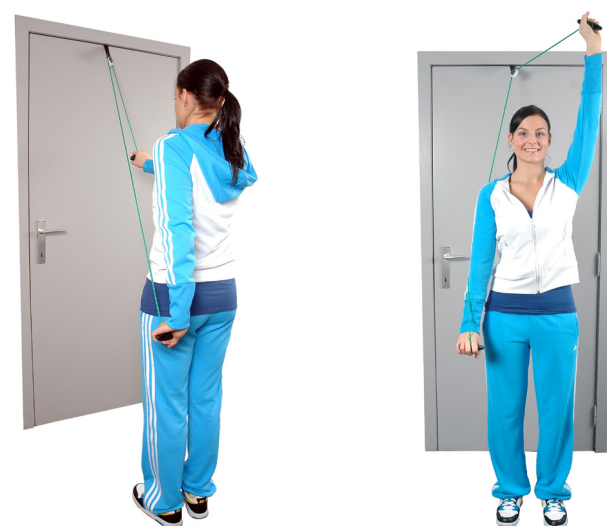
Up and Down Facing the Door

All these exercises can also be performed in a standing position: